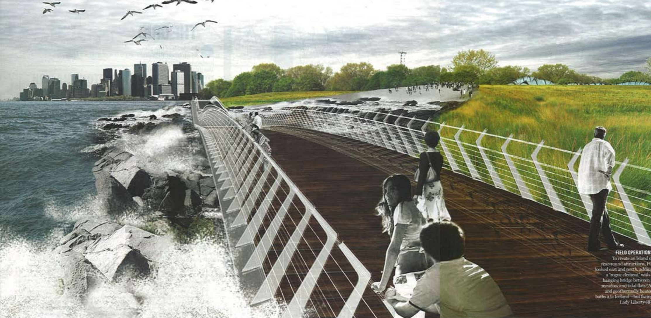
FIELD OPERATIONS To create an island of year-round attractions, FO looked east and north, adding a "rogue element" with a hanging bridge between a meadow and tidal flats (A) and geothermally heated baths à la Iceland—but facing Lady Liberty (B).