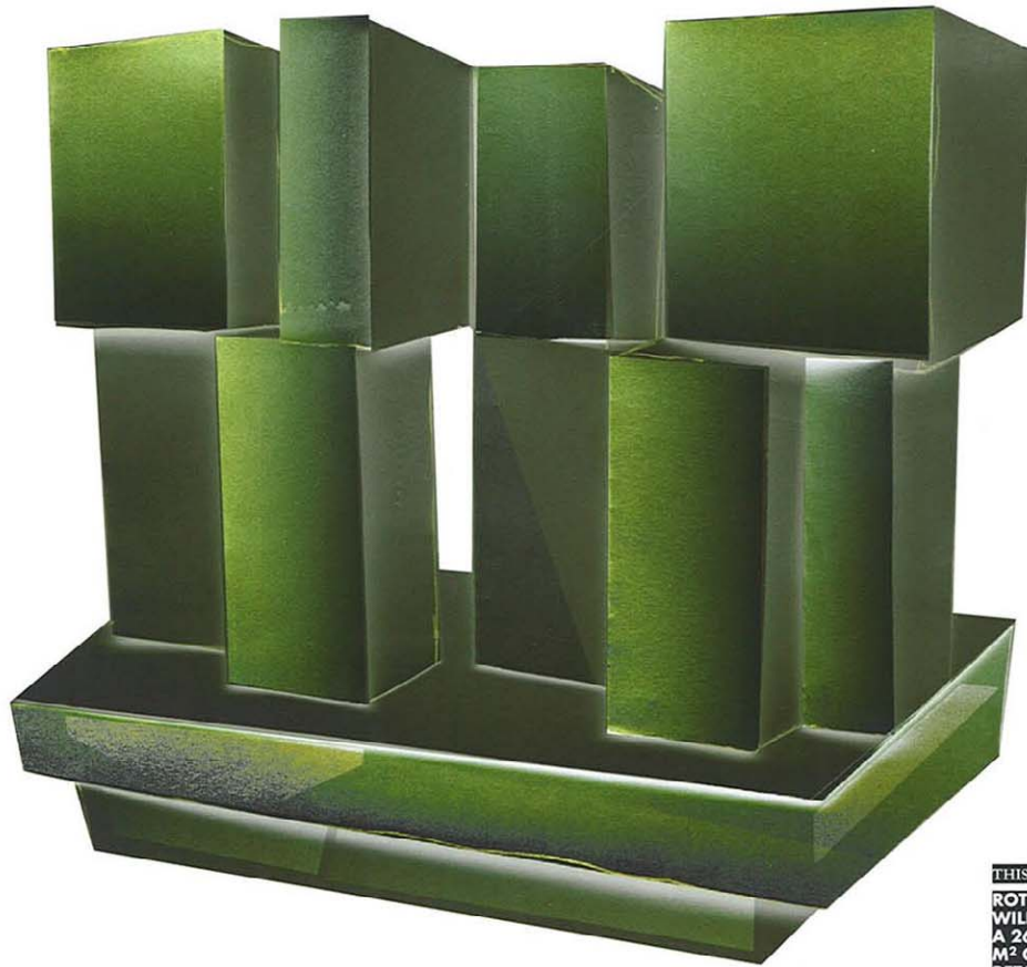
THIS PAGE OMA, DE ROTTERDAM. ROTTERDAM. THIS 140,000-M 2 BUILDING WILL COMPRISE 260 APARTMENTS AND A 260-ROOM HOTEL, AS WELL AS 40,000 M 2 OF OFFICE SPACE AND 5000 M 2 OF RETAIL SPACE. COMPLETION IS SCHEDULED FOR 2011.

LAST SUMMER LONDON'S TATE MODERN revealed plans for a new extension, designed by Swiss architects Herzog & de Meuron, who had converted the disused power station on London's South Bank into the Tate Modern in 2000. The two architects have described their new design as a 'pile' of boxes, while others have likened it to a ziggurat or a pyramid. I don't often find myself agreeing with other architects on the proper description of their buildings, but I must say that 'pile' is indeed what comes closest to describing the proposed extension.